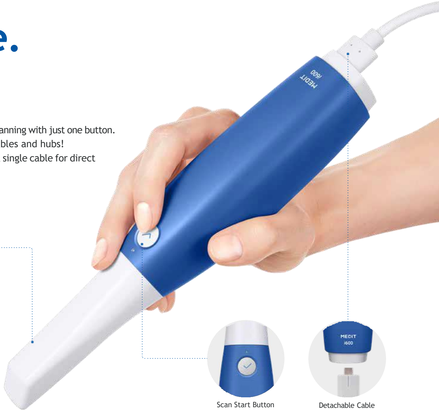
Scan Start Button