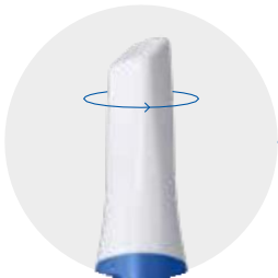
180° Reversible Tip

Take full control of your scanning with just one button. No need for numerous cables and hubs! Simply Plug & Scan using a single cable for direct connection with a PC.